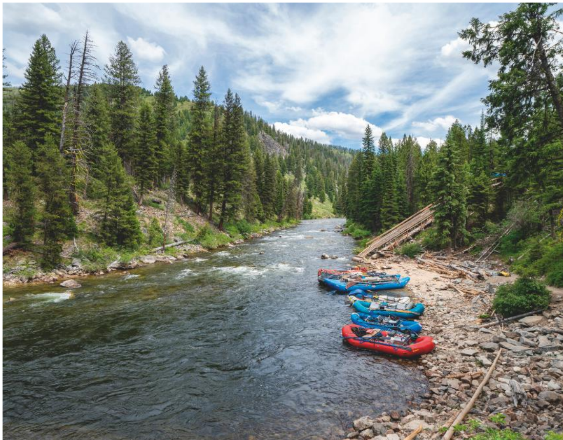
ABOVE: Rafting on Middle Fork Salmon River in Idaho

“The key to selling the US wilderness is to ensure your clients are willing to go with the flow. Following a set itinerary exactly can sometimes go out the window – but tour leaders are skilled at changing plans at short notice, including to spot wildlife they’ve heard is nearby.”