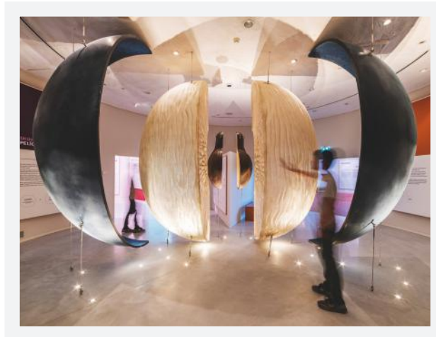
TOP: The Wine School at World of Wine

Scott Dunn offers a seven-night stay at The Yeatman, a luxury wine hotel and spa overlooking the Douro River and located next to World of Wine, from £5,600 based on a couple sharing an Executive Room on a bed-and-breakfast basis. The price includes return flights from the UK and private transfers. scottdunn.com