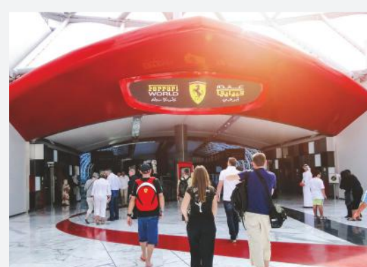
TOP: The Formula Rossa rollercoaster

Tui offers seven nights' B&B at the Hilton Abu Dhabi Yas Island from £1,538 per person, based on two adults and two children sharing a Double Room. The price includes luggage, transfers and flights departing Heathrow on July 28. Ferrari World Abu Dhabi tickets cost £73 via Tui Musement. tui.co.uk