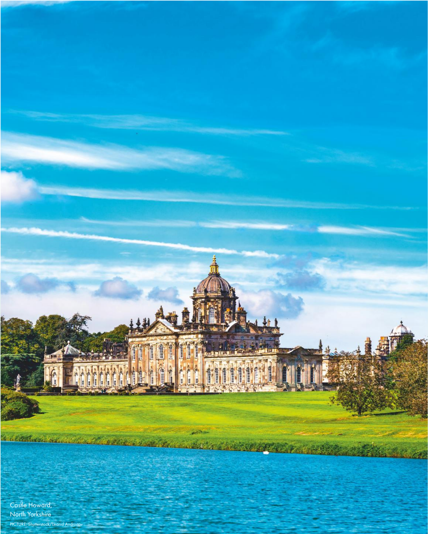
Castle Howard, North Yorkshire