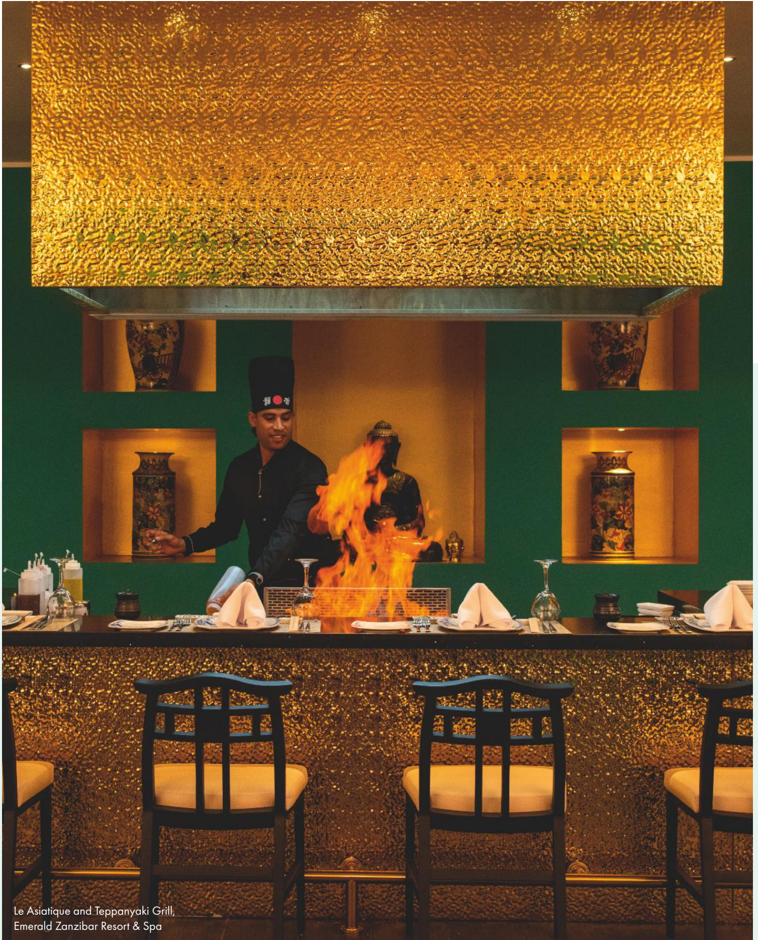
Le Asiatique and Teppanyaki Grill, Emerald Zanzibar Resort & Spa